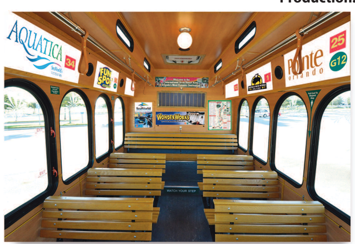
*Advertising Rates are monthly.

Vertical Size: 17" wide x 23.5" tall Interior Back Wall: $210/sign* Production: $115/sign